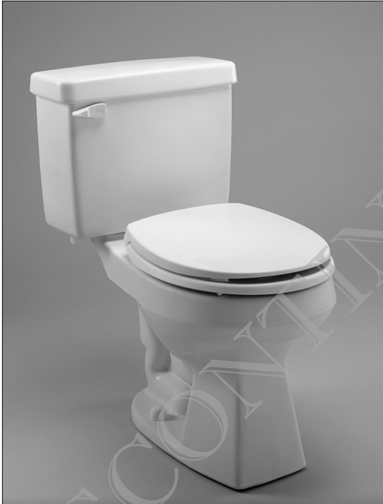
CST703 - 1.6 Gpf Toilet SS113 - SoftClose Toilet Seat