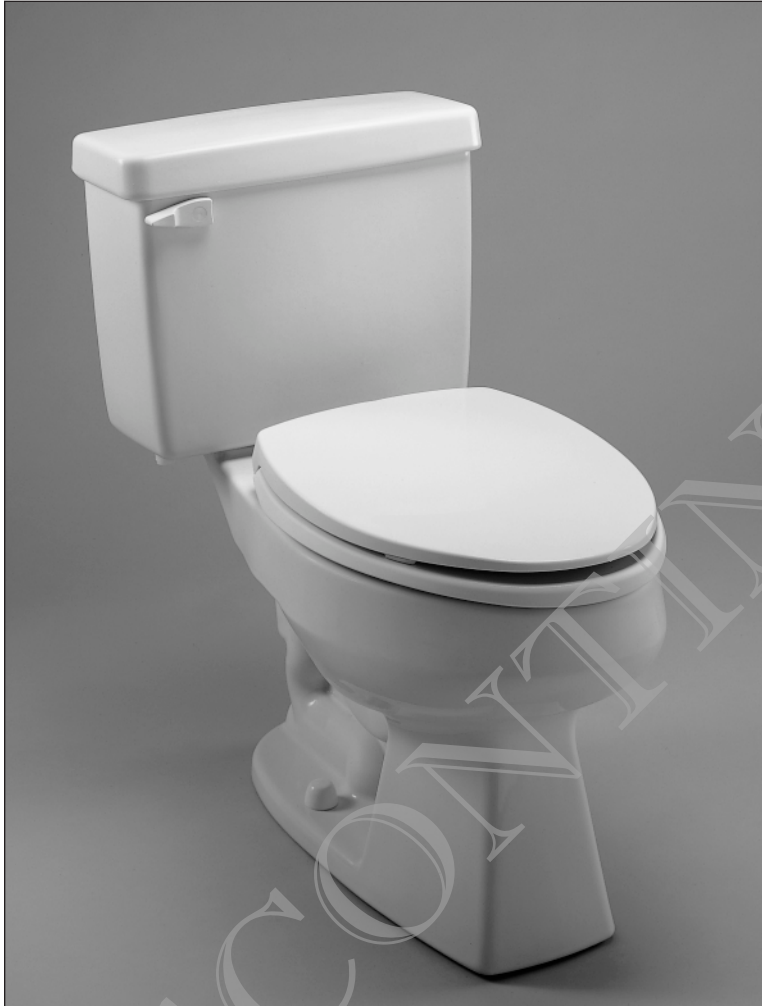
CST 704 - 1.6 Gpf Toilet SS114 - SoftClose Toilet Seat

Colors: Standard #01 Cotton Optional See price book for additional colors