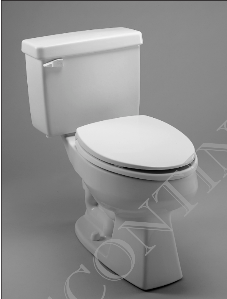
CST 704 - 1.6 Gpf Toilet SS114 - SoftClose Toilet Seat

Colors: Standard #01 Cotton Optional See price book for additional colors