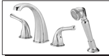
D301771 (Shown) PLYMOUTH™

Danze products are covered by a manufacturer's limited "lifetime" warranty for manufacturing defects.