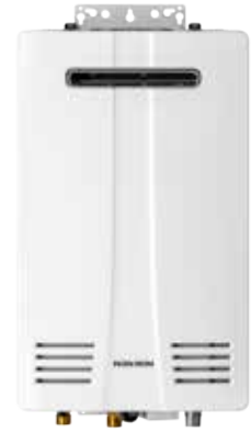
EXTERIOR - Non-Direct Vent OUTDOOR use only