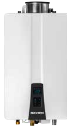
UNIVERSAL - Concentric Direct Vent INDOOR or OUTDOOR (with Vent Kit)